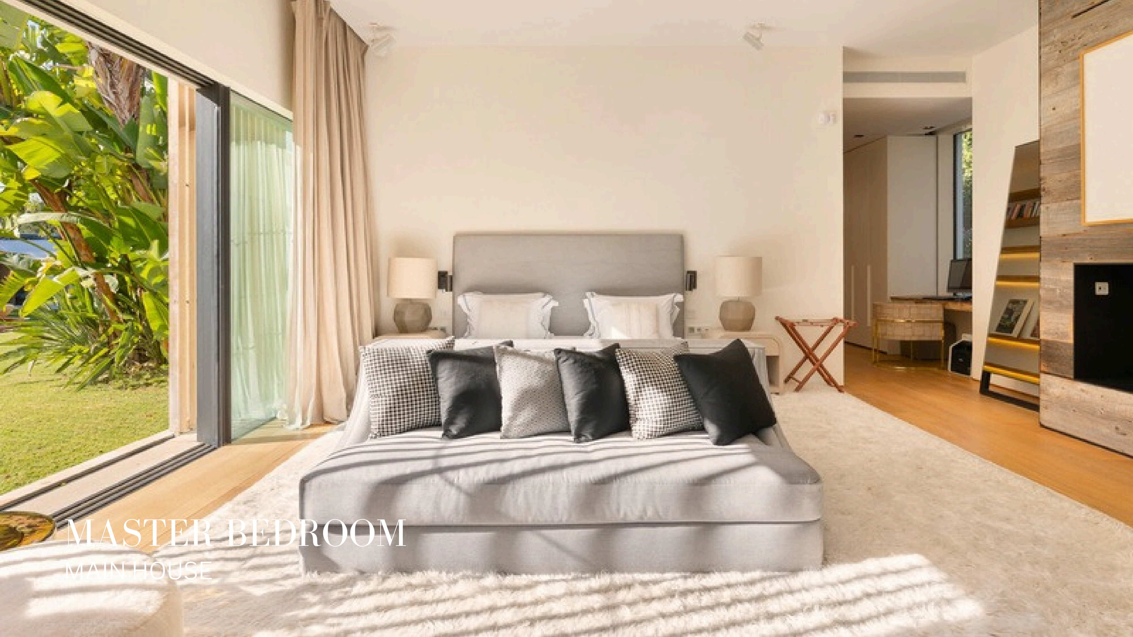
MASTER BEDROOM MAIN HOUSE