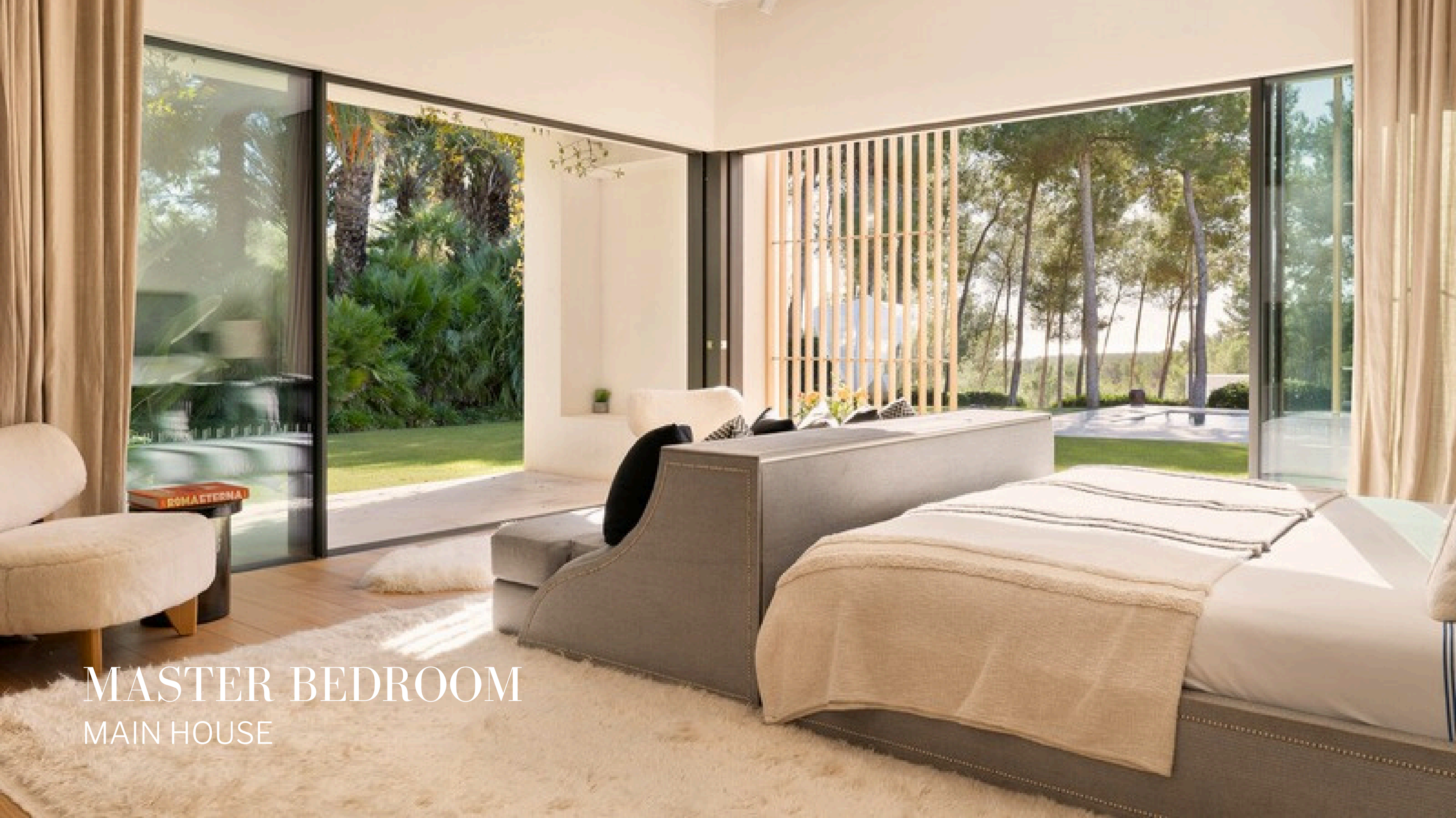
MASTER BEDROOM MAIN HOUSE