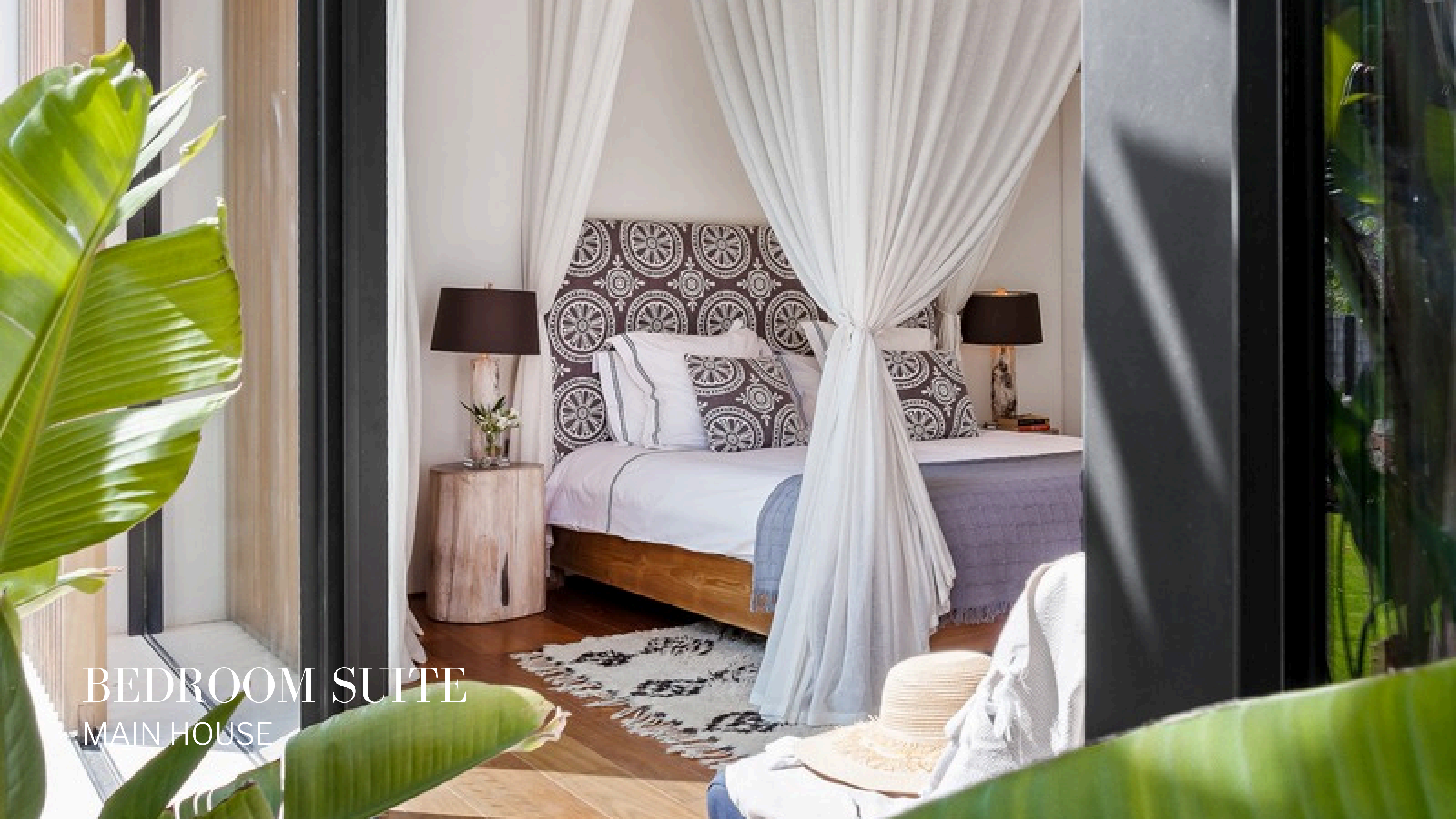
BEDROOM SUITE MAIN HOUSE