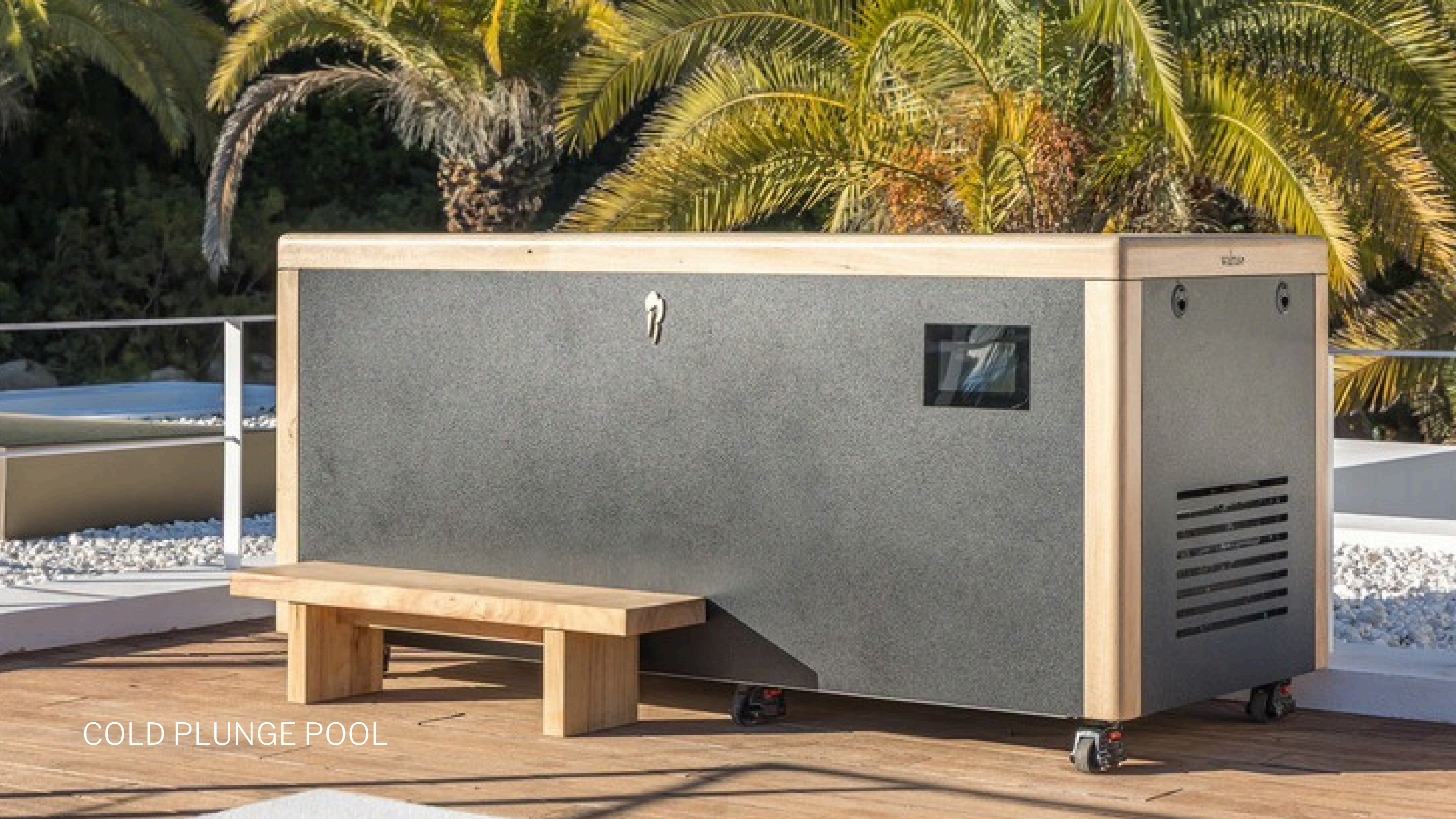
COLD PLUNGE POOL