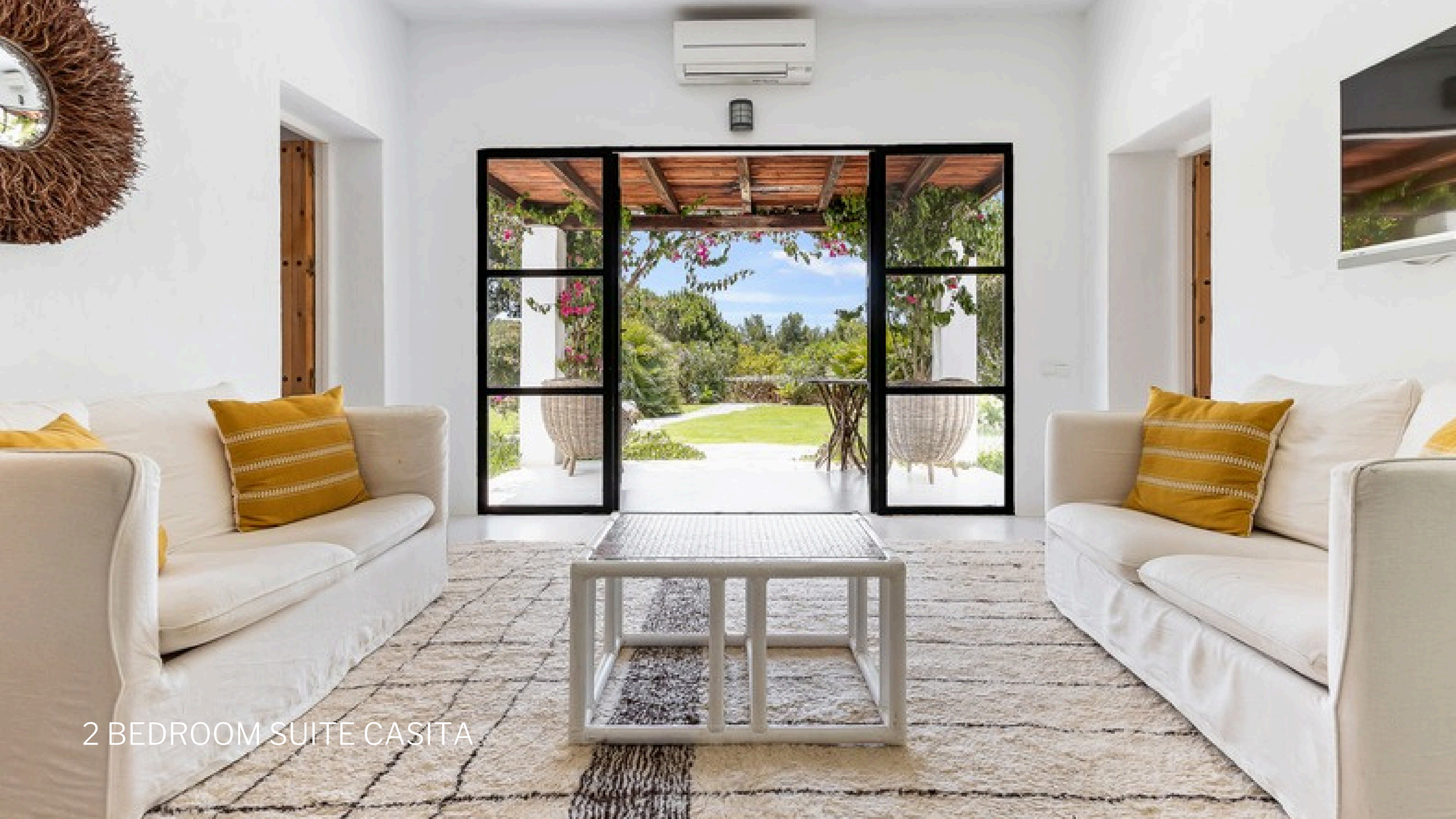
2 BEDROOM SUITE CASITA