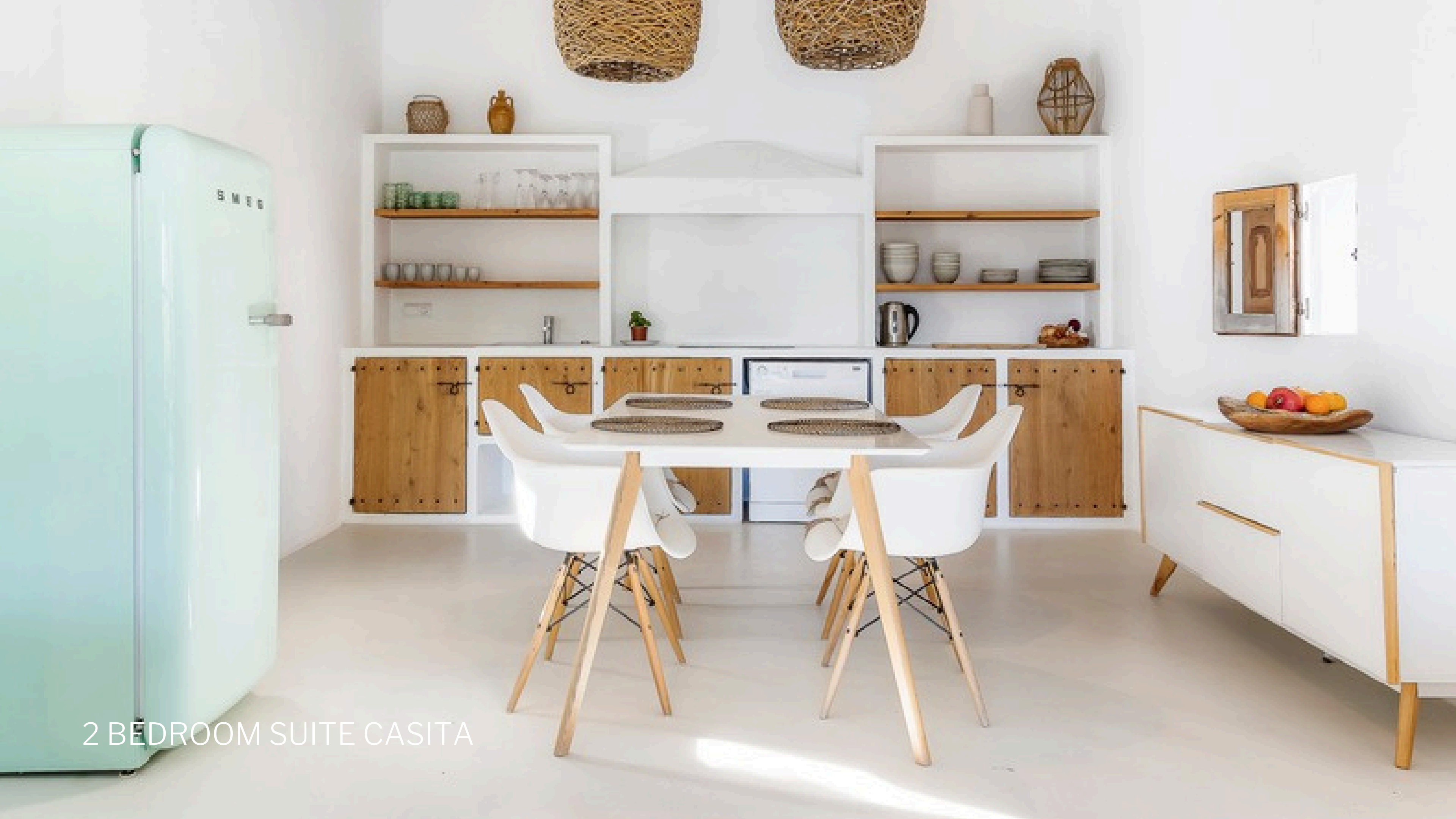
2 BEDROOM SUITE CASITA