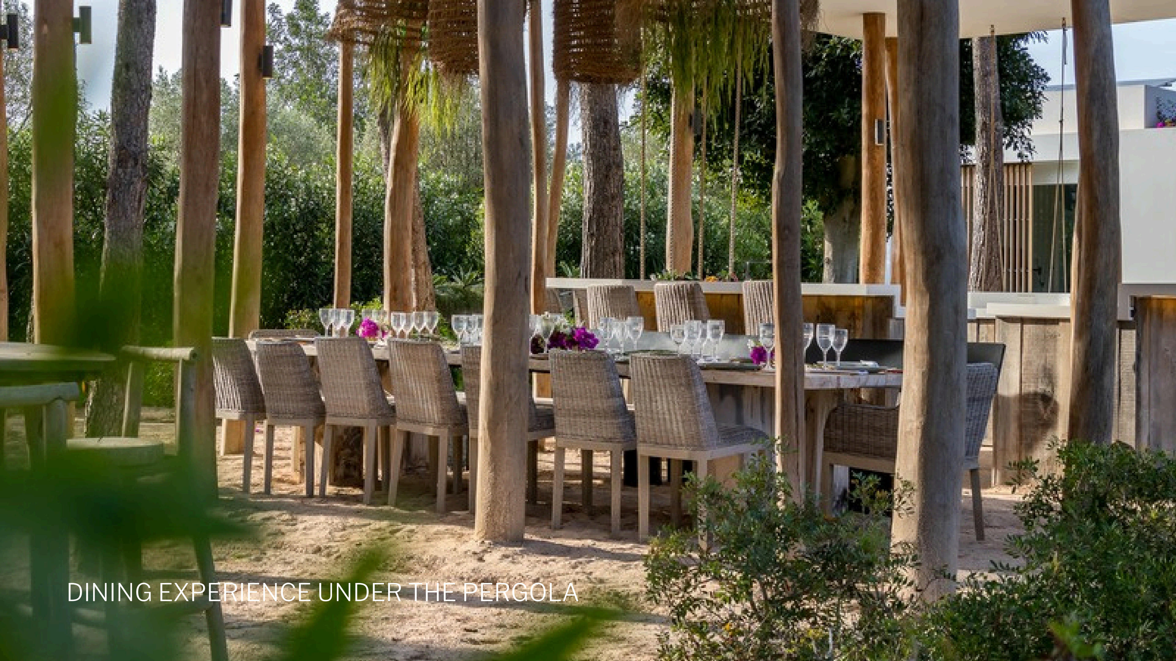
DINING EXPERIENCE UNDER THE PERGOLA