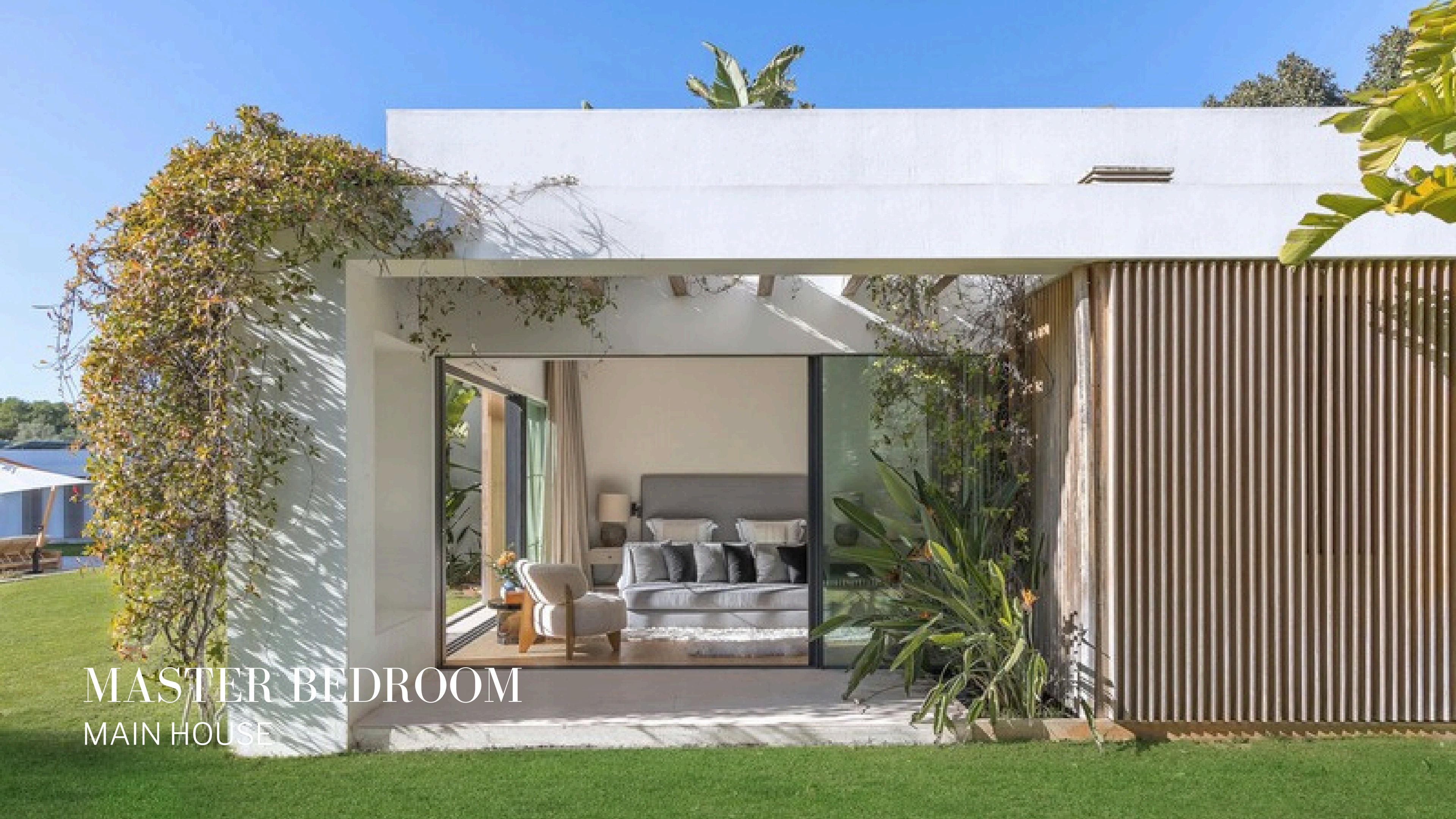
MASTER BEDROOM MAIN HOUSE