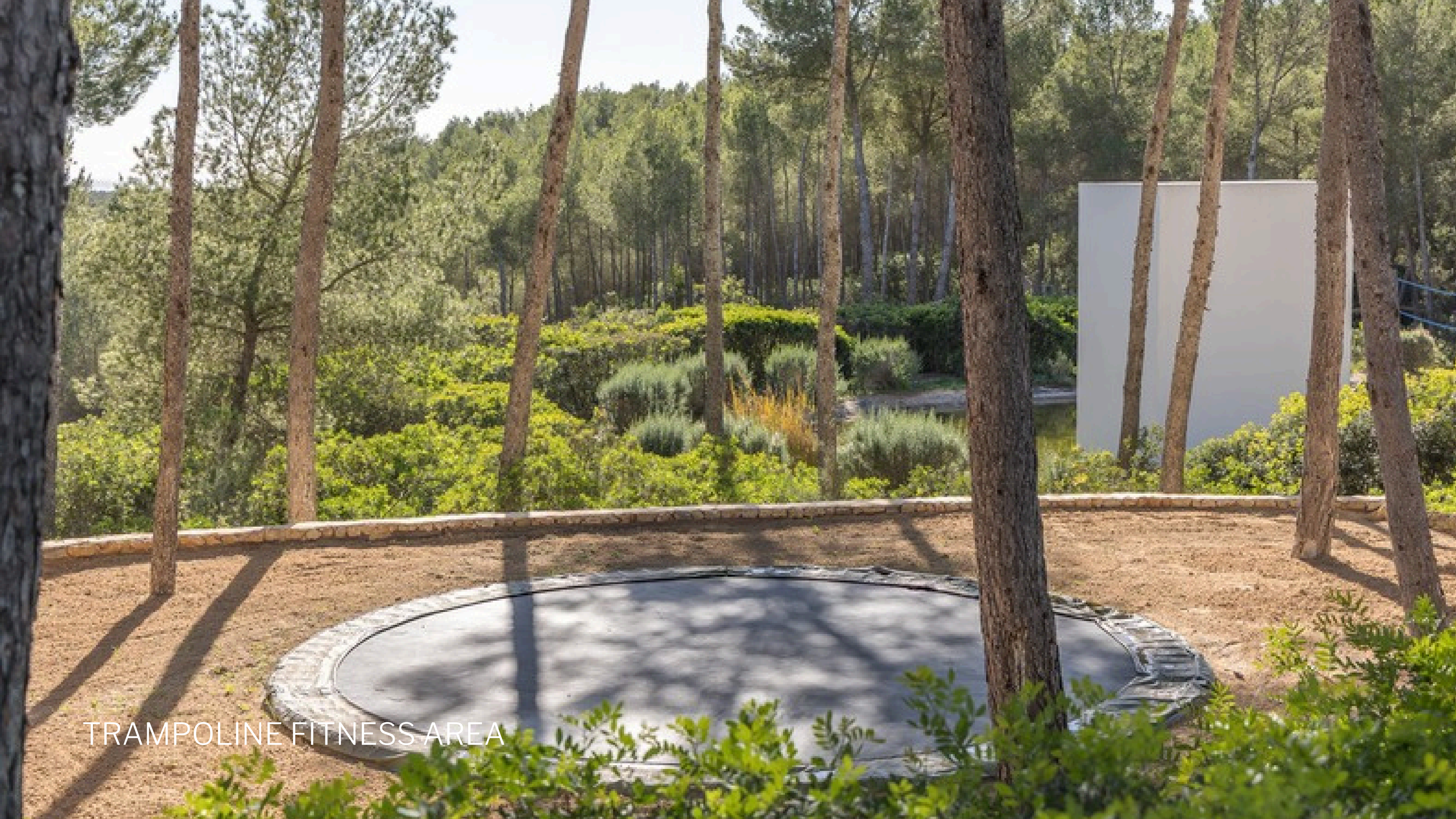
TRAMPOLINE FITNESS AREA